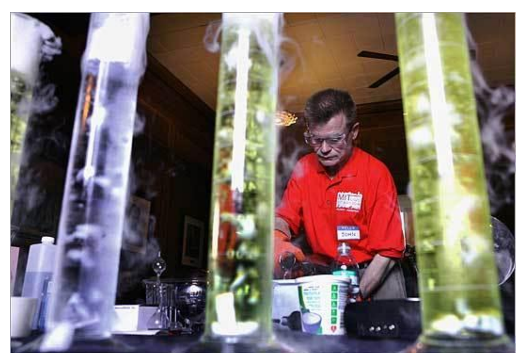
This content is excluded from our Creative Commons license. For more information, see <a href="http://ocw.mit.edu/fairuse">http://ocw.mit.edu/fairuse</a>.