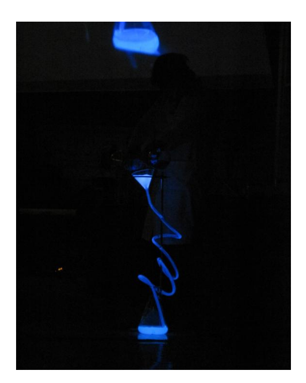
Photo taken at MIT 150<sup>th</sup> Celebration Open House Under the Dome April 30, 2011 Courtesy of Nathan Sanders. Used with permission.