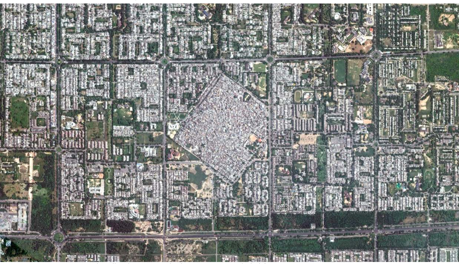
© Google. All rights reserved. This content is excluded from our Creative Commons license. For more information, see http://ocw.mit.edu/help/faq-fair-use/.

The paper analyses the construct of village as opposed to a city and agricultural land, as a result of prevalent land systems and revenue mechanisms in the Indian state of Punjab. It traces the evolution of urban villages in Chandigarh as excluded places from the realm of planning, since the colonial era to its nested co-existence within the urban fabric. Reflecting upon the lessons learnt in the process - the potentials offered and challenges faced, it explains factors responsible for their unique development trajectory. The paper concludes with suggestions for an alternative development pathway which can enable a smooth transition of the place from a rural, agricultural settlement to an integrated node within the city.