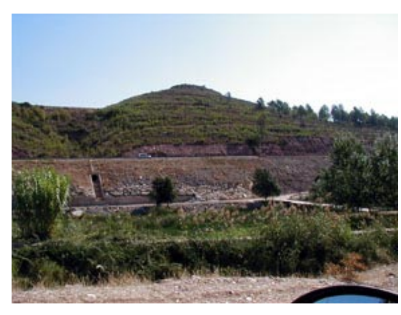
New road and river edge- Antius/Suria

The mill is at the end of the parkand the canal runs through it. Riffles in the river. A small dirt roadrunning behind the mill up to from fields to the west of the river and mill.