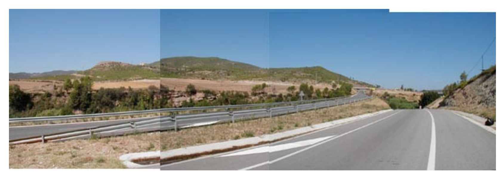
By-pass Junction - new industrial zone enrt- Suria