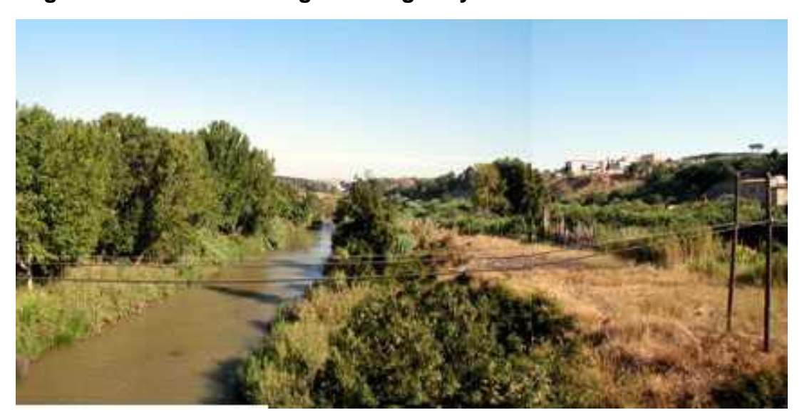
Looking North to San Joan from pedestrian bridge

At the outset how to mange the 90 degree bend in the river at the bridge at Pont del congost? How to make a good pedestrian connection to the park?