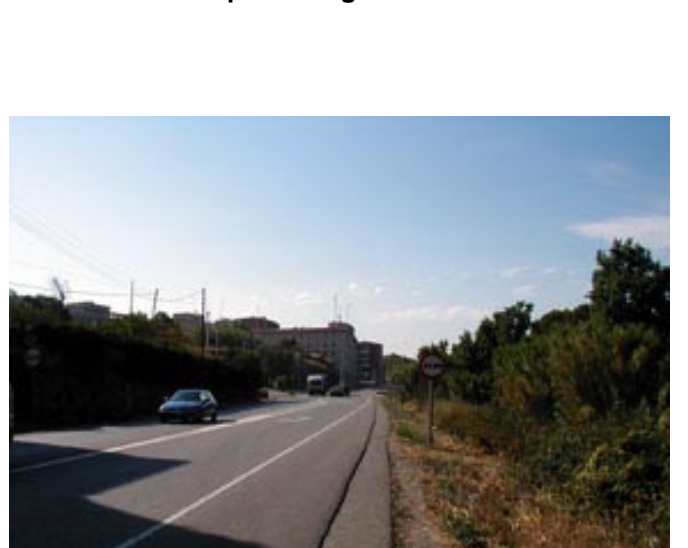
Entry Rd. View South