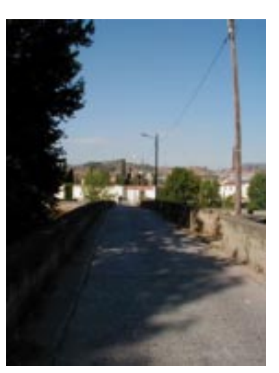
View to cemetary