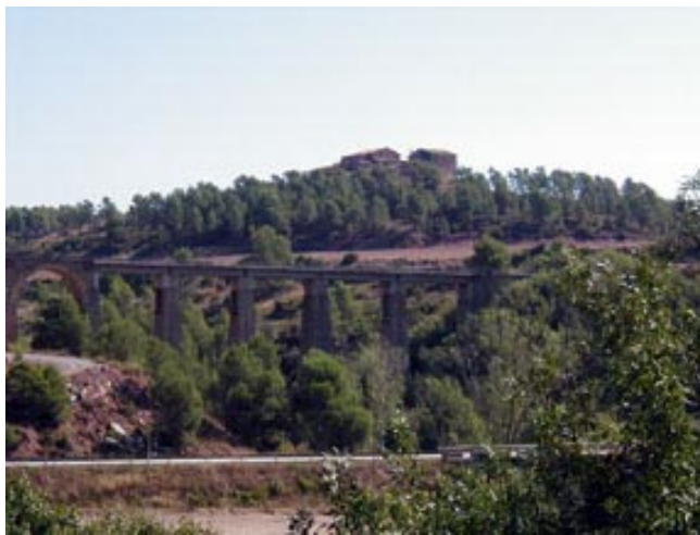
View from Antius South