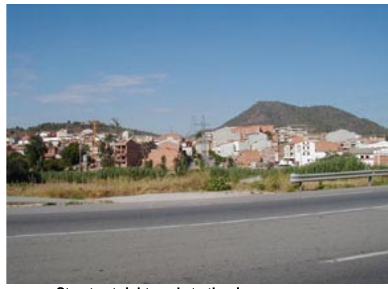
Streets at right angle to the river

Garden plots south of the bridge. Falls at the bridge.