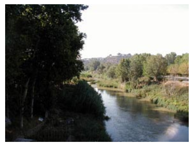
View South from ped. bridge