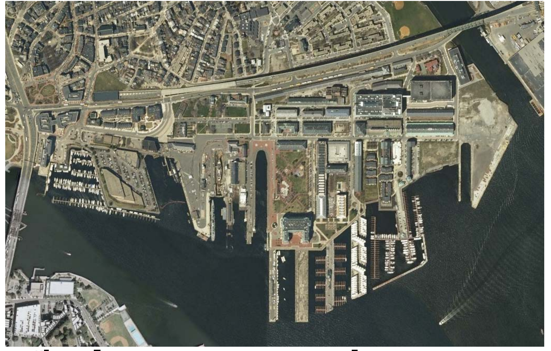
Charlestown Navy Yard Resources