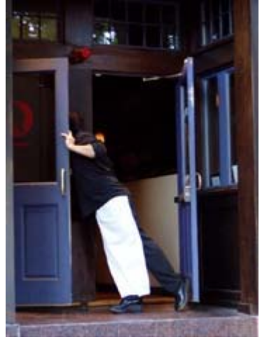
5:30 p.m.: Doors Open