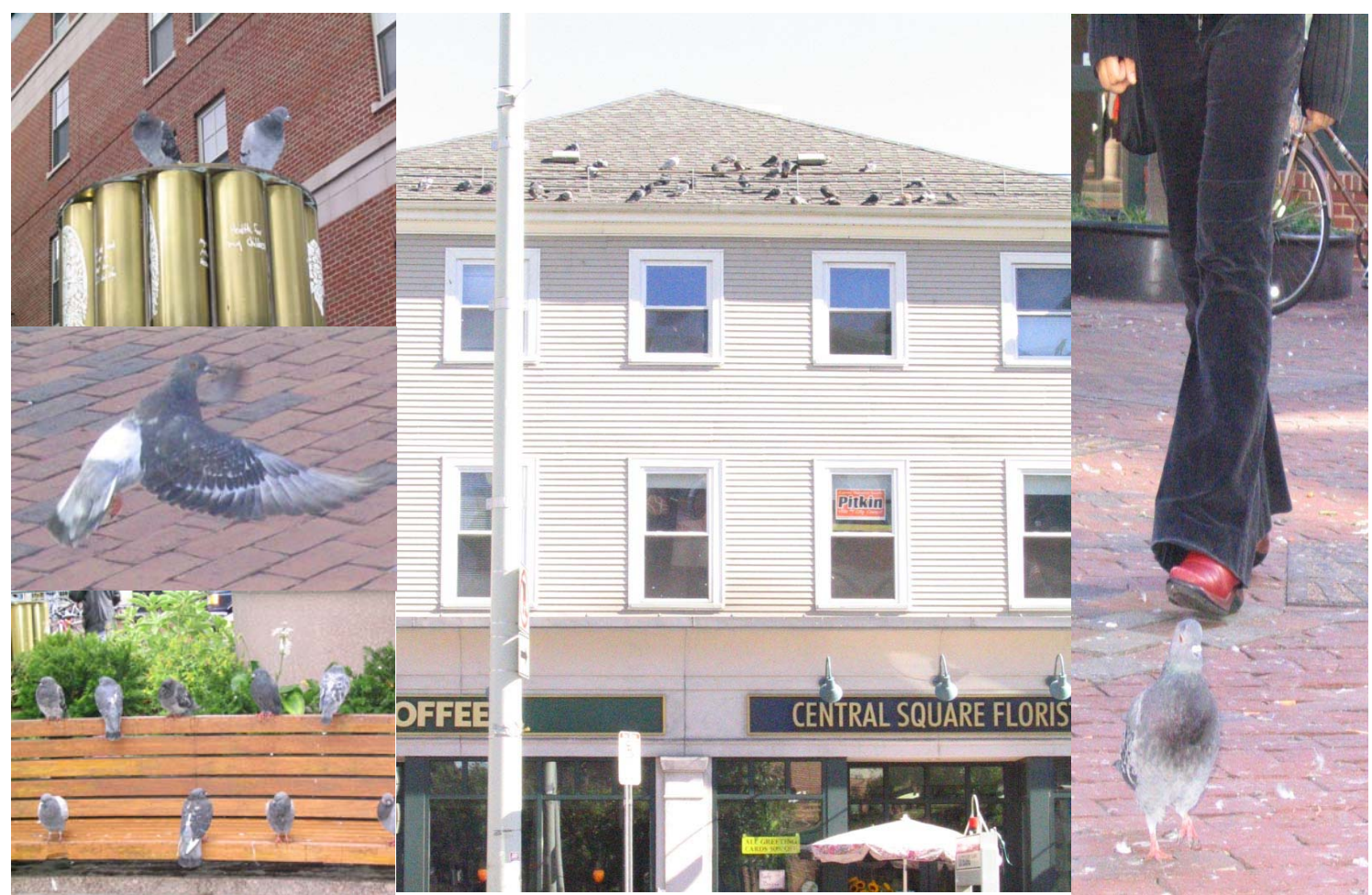
Central Square, Cambridge, MA Fall 2003