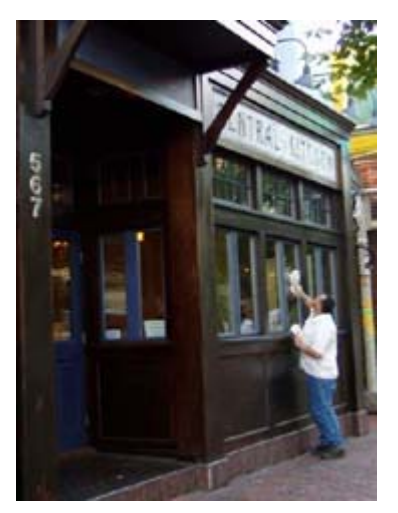
7 a.m.: <u>Rehearsal</u>