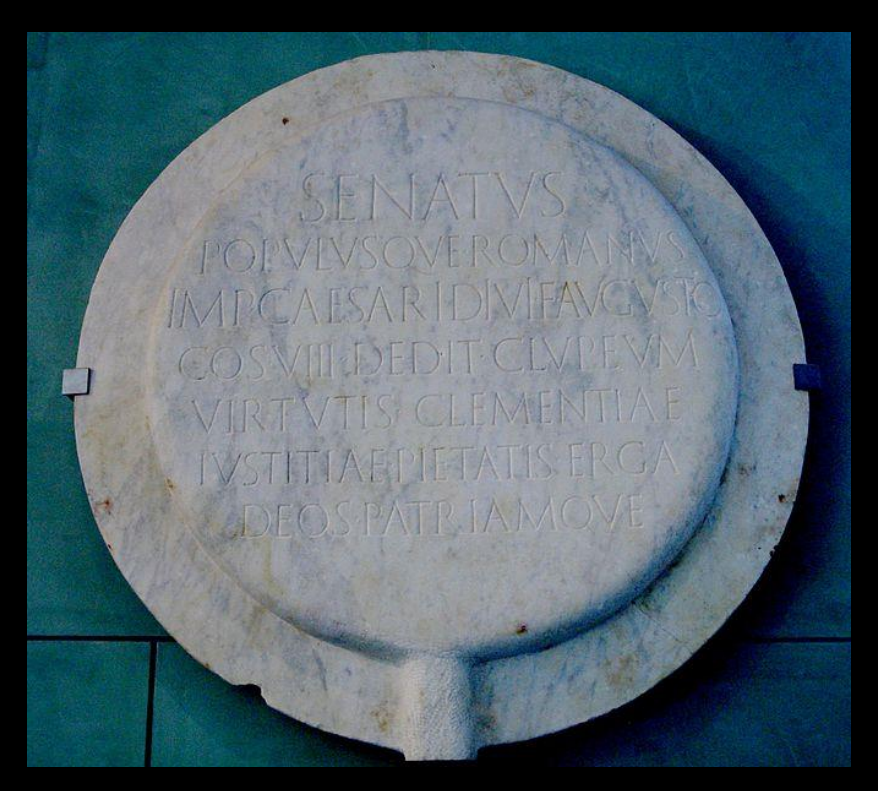
Image courtesy of Marajaara. Source: Wikimedia Commons. License CC BY.