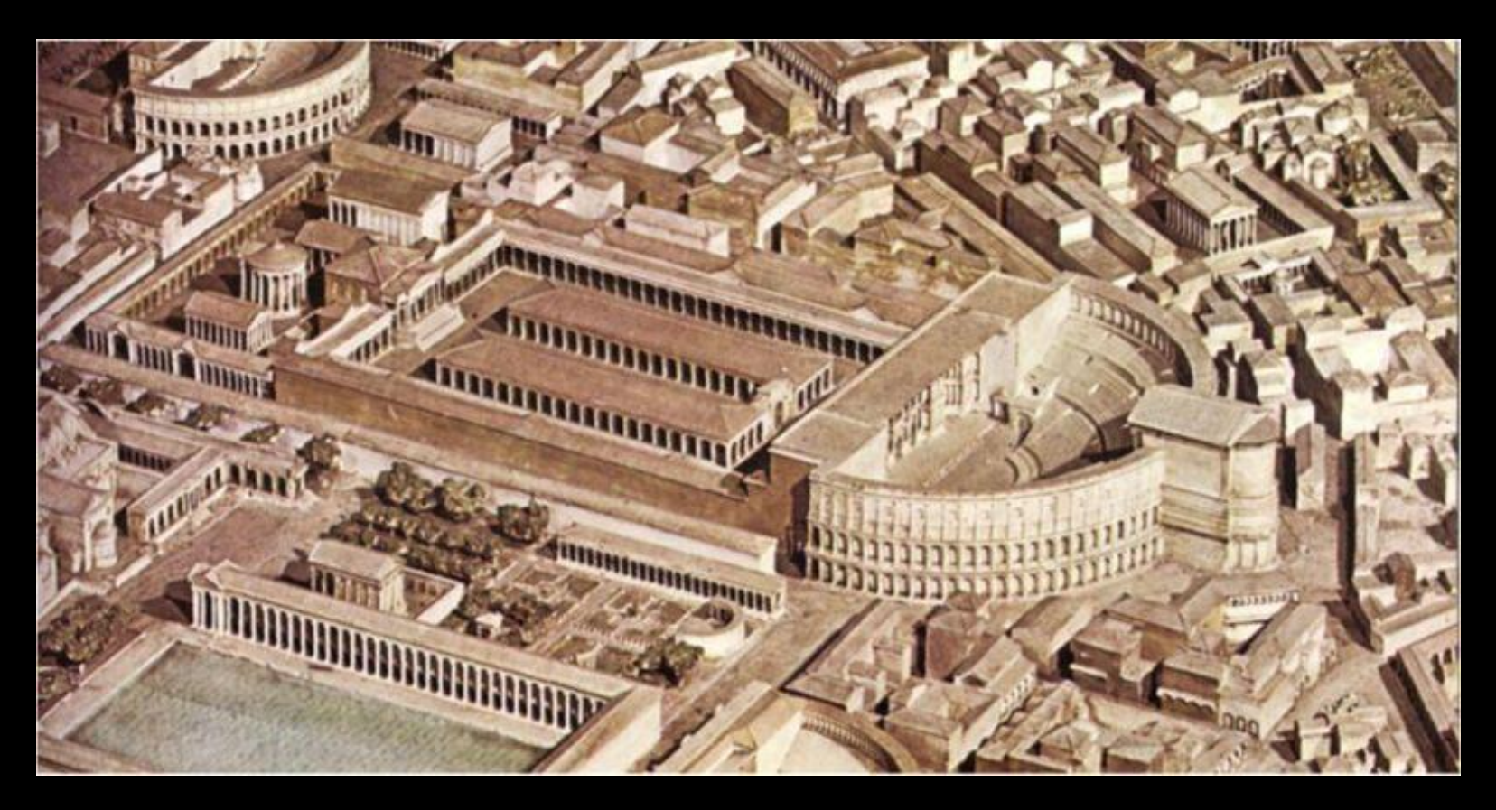
Image courtesy of the Theatrum Pompei Project. This image is in the public domain. Source: Wikimedia Commons.