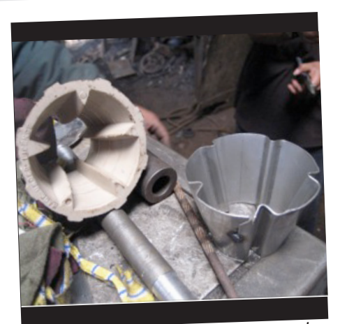
Fig 1 The sheet metal sheller, made at the Fainsa workshop (right) and the original plastic sheller that is was modeled after (left).

We will use the water jet cutter to cut the sheet metal parts. If you are unfamiliar with the OMAX software and other CAD programs, run through the OMAX tutorial before class (there is a copy of the OMAX software that you can download onto your laptop or you can use one of the D-Lab laptops). Use the OMAX Layout program to generate the tool path for the parts and cut your part out before the next class.