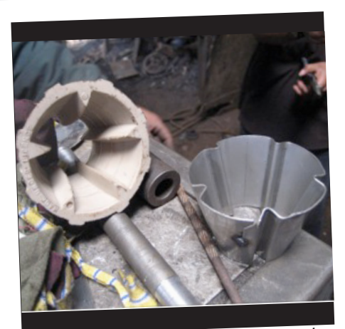
Fig 1 The sheet metal sheller, made at the Fainsa workshop (right) and the original plastic sheller that is was modeled after (left).

We will use the water jet cutter to cut the sheet metal parts. If you are unfamiliar with the OMAX software and other CAD programs, run through the OMAX tutorial before class (there is a copy of the OMAX software that you can download onto your laptop or you can use one of the D-Lab laptops). Use the OMAX Layout program to generate the tool path for the parts and cut your part out before the next class.