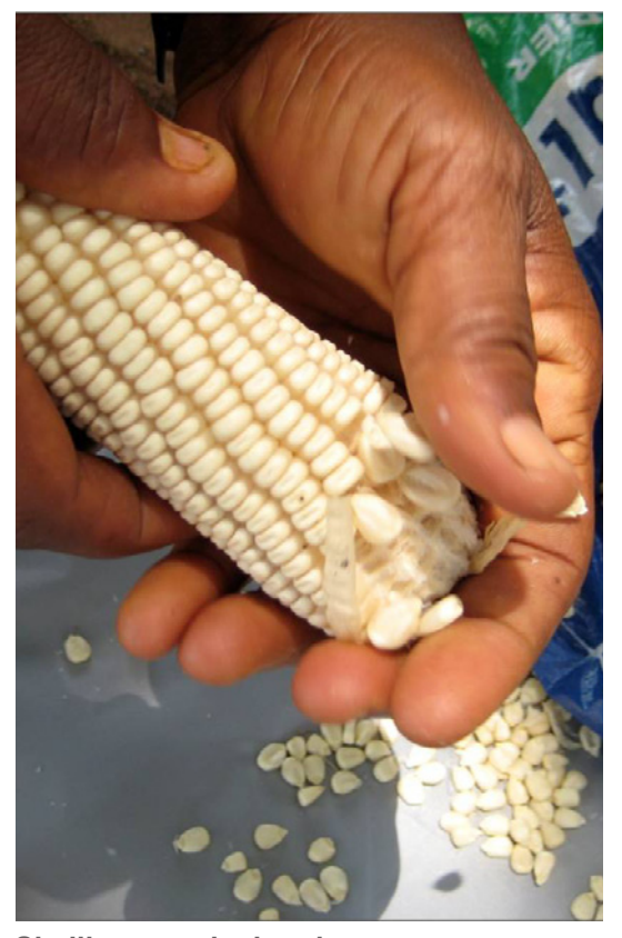
Shelling corn by hand.

Existing alternatives to shelling maize by hand are often unaffordable or difficult to obtain for subsistence farmers. An estimated 550 million small-holder farmers in the world lack access to mechanized agricultural technology. Industrial maize shellers are prohibitively expensive, with a cost range of US$1,200-1,800; small-scale hand-cranked or pedal-powered maize shellers cost US$20-50, which is still more than many families can afford. While industrial shellers are highly productive, their energy infrastructure requirements can render them unusable in rural villages. Furthermore, mechanized equipment and stationary pedal-powered devices are difficult to transport to the users. As a consequence, farmers may be required to travel long distances to process their crops or the technology may not be able to reach the communities who need it most.