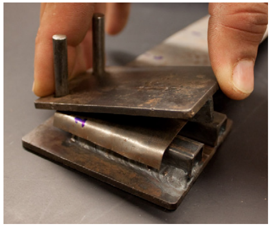
Sheet metal corn sheller forming jig.