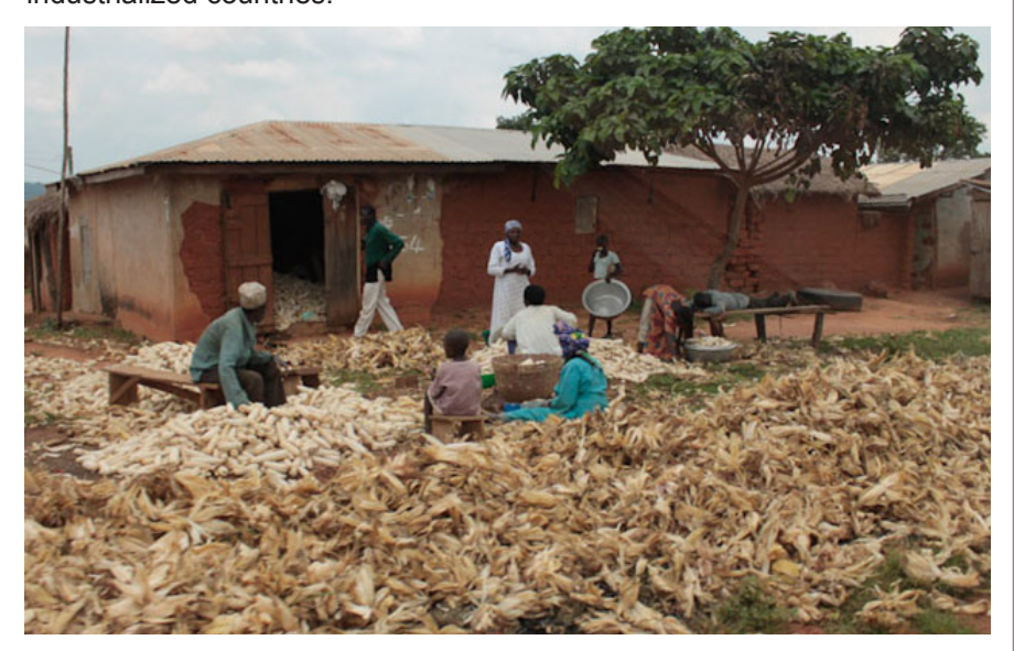
Shucking and shelling corn in rural Ghana.

Maize (corn) is one of the most important staple crops in the world. In Kenya, for example, 45% of the population considers Ugali (maize meal) to be their survival food, making it the most consumed food of the country. Maize also accounts for 43% of the Latin American diet. In Asia, maize production is over 200 billion kilograms a year and it is expected that the total maize production in developing countries will eventually overtake production in industrialized countries.