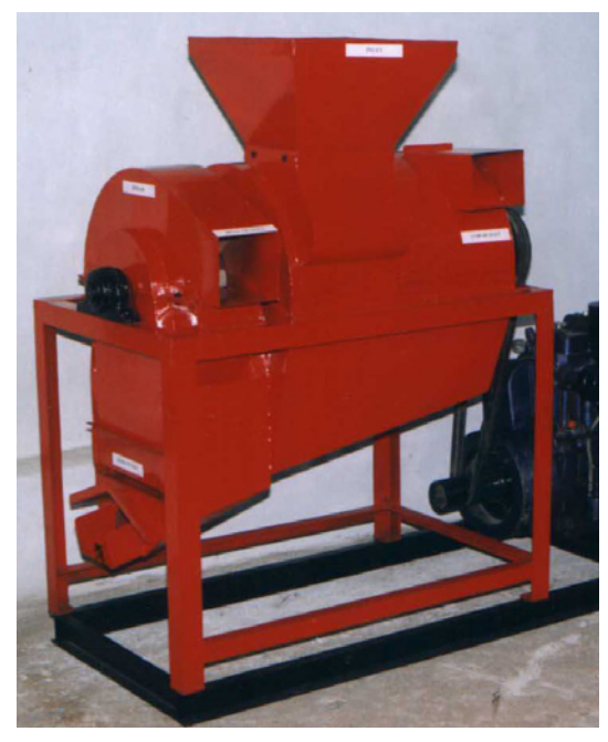
A mechanized corn sheller.