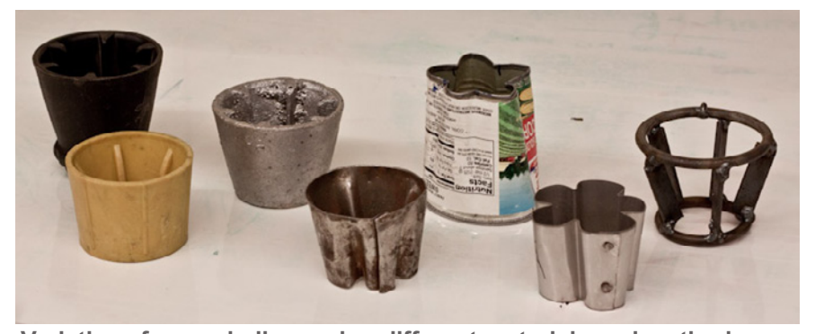
Varieties of corn shellers using different materials and methods.

These materials are provided under the Attribution-Non-Commercial 3.0Creative Commons License, <a href="http://creativecommons.org/licenses/by-nc/3.0/">http://creativecommons.org/licenses/by-nc/3.0/</a>. If you choose to reuse or repost the materials, you must give proper attribution to MIT, and you must include a copy of the non-commercial Creative Commons license, or a reasonable link to its url with every copy of the MIT materials or the derivative work you create from it.