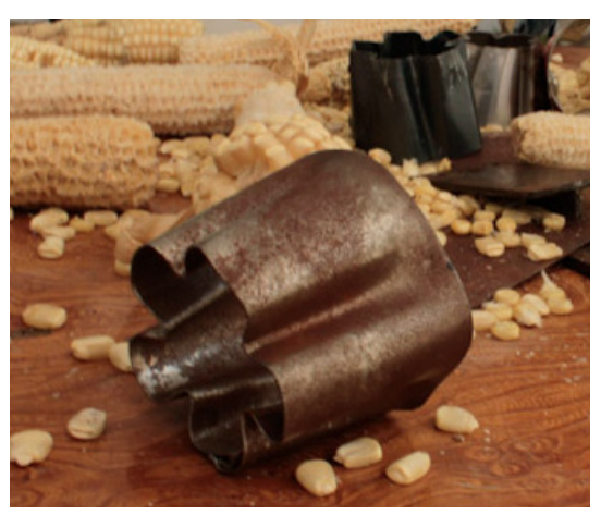
Sheet metal cornsheller and shelled corn.