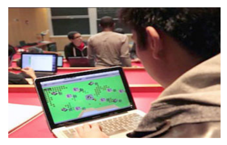
A student playtesting a game.

Can you spend hours playing <u>Halo</u> or <u>Assassin's</u> <u>Creed</u> on your gaming system? Or maybe you prefer <u>Bejeweled</u> or <u>Tetris</u> on your mobile phone?