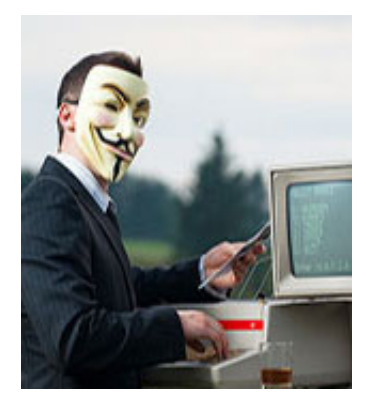
CMS.701 Current Debates in Media