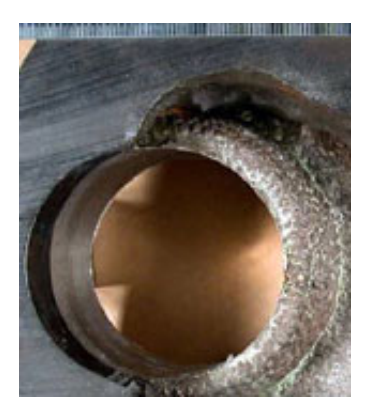
22.14 Materials in Nuclear Engineering