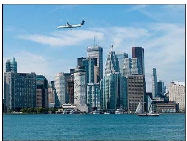
The principles of engineering dynamics are incorporated into the design of buildings, planes, boats, and underlie and explain phenomena we see every day.

Also presented on the OCW site, <u>2.003SC Engineering</u> <u>Dynamics</u> is a special type of OCW publication designed to serve the needs of independent learners. OCW Scholar courses include very robust sets of course materials organized in logical sequences of units rather than the organization by content type that is used in the standard OCW presentation. The starting point for these courses is existing residential course content, but significant alterations and additions are required.