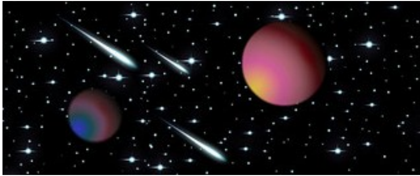
Illustration of a meteor shower.

You have no doubt heard about the meteor that exploded over Russia recently! Well, if that made you curious about astronomy, then we suggest you check out the following courses: