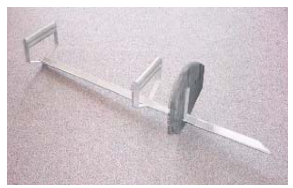
Figure 2. The D-handle pick prod.