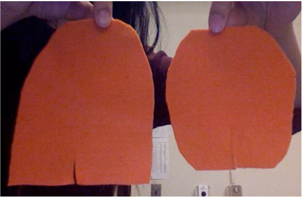
Cloth patterns for the deflectors.

Manufacturers have to be careful when placing the magnet (or suction cup) because slight variations can significantly change the angle of the deflector. If the angle is off, it might become uncomfortable or ineffective at deflecting fog.