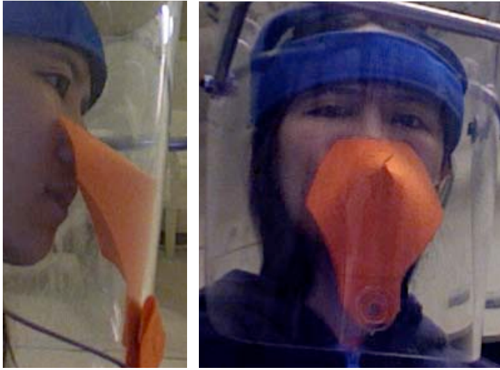
This early prototype, made of sewn hard felt, illustrates the original breath deflector shape, which had a substantial pucker in the middle and a heart-like shape at the top. Here we are testing both the magnet and suction cup methods of attachment.

We made prototypes using last year's mask design and hard orange felt but with various different attachment mechanisms both on and off the face. Eventually we decided that attaching the deflector with a magnet would be the top alternative. Using a suction cup to attach the deflector came in as a close second choice. Our experiments are detailed in the Appendix.