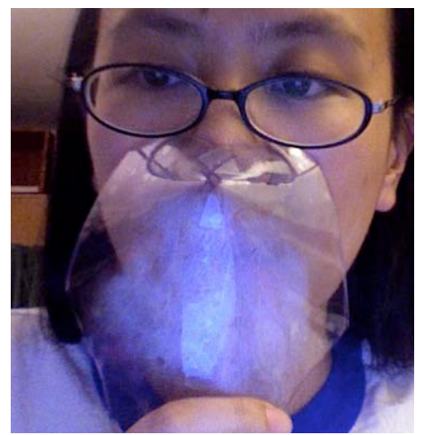
You can see a clear deflector working.

The bright orange prototypes also made us think more about what we wanted the final material and appearance of the deflector to be. After some discussion and more prototypes, we decided the a transparent deflector would be best.