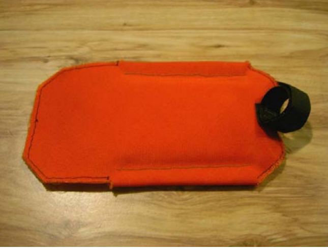
Picture 4: Handshield design for the clipper. From top left clockwise: the back view, with the pouch visible; the front view; the handshield incorporated into the clipper; the handshield in actual use.