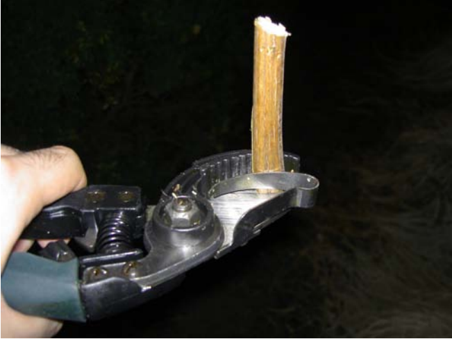
Picture 7: Pictures from field tests. From left to right: a depiction of branches classified as thin and thick, with a pen as a reference; a cantilever spring gripper is demonstrated with the Corona CH7720 pruner.