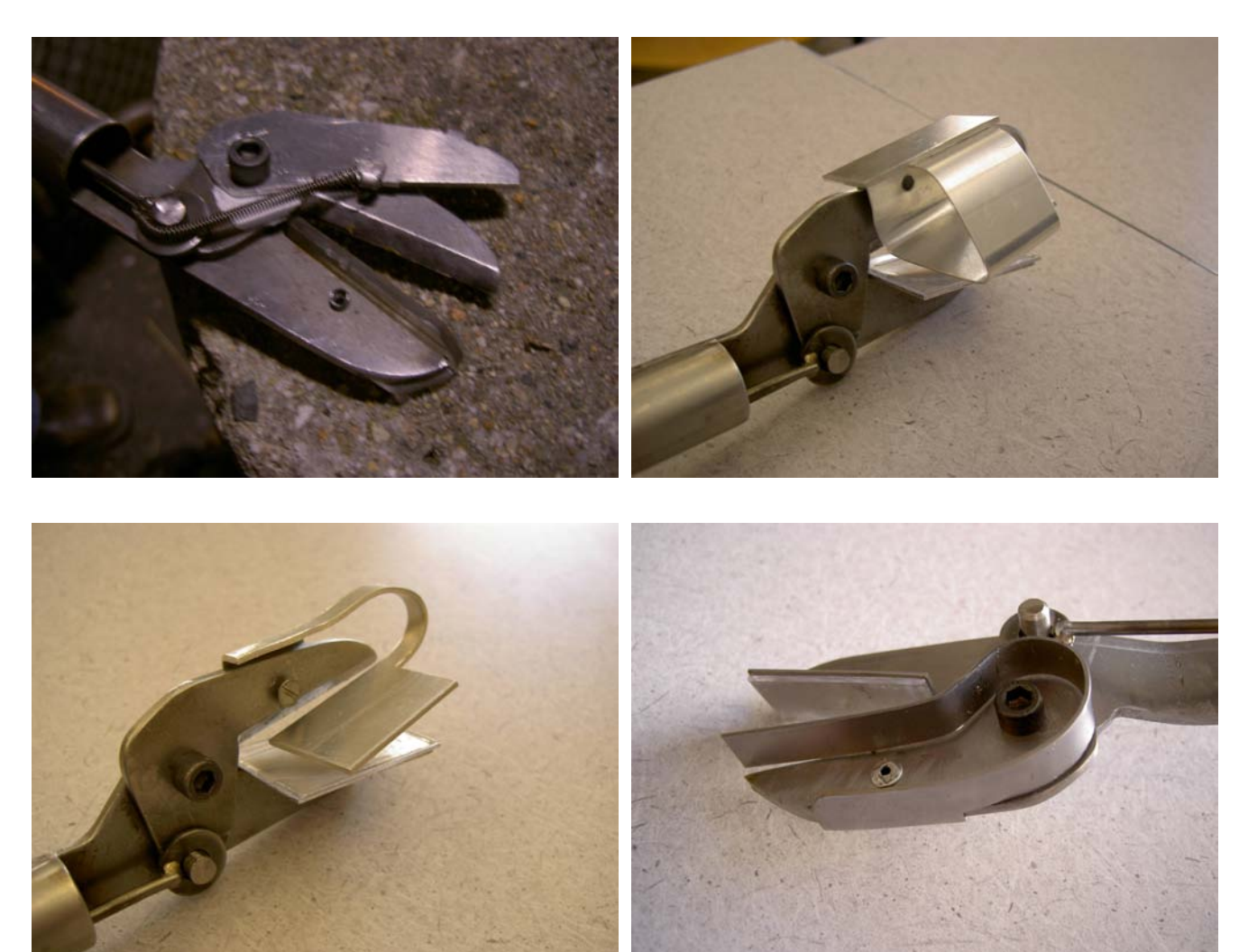
Picture 5: Various gripper design proposed. From top left clockwise: a coil-spring actuated gripper, a vertical cantilever spring gripper, a horizontal cantilever spring gripper that wraps out backward, and a regular horizontal cantilever spring gripper.