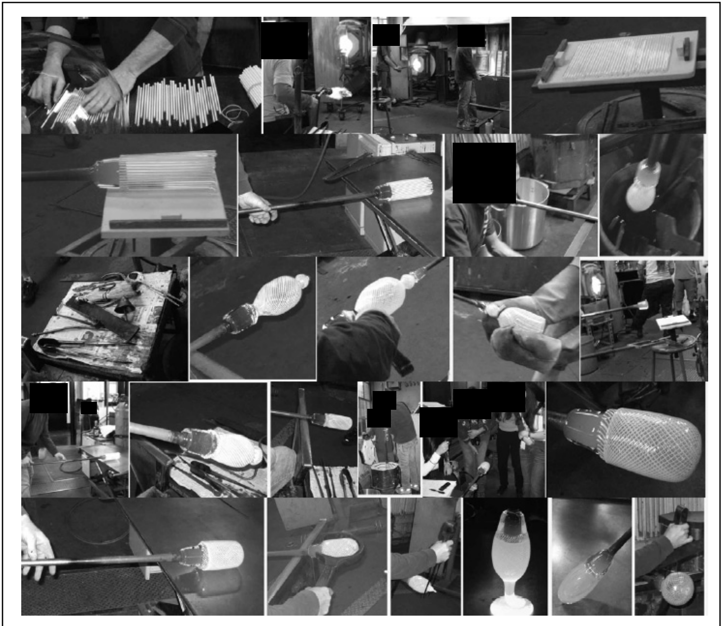
Figure by MIT OpenCourseWare.

Peter Houk lays out glass canes having a white core (1). An artist torches heat onto a glass lamp (2). Peter and Whitney work in two furnaces at once (3), coordinating the preparation of the plate of canes (4) and the glass glob that picks them up (5). Rolling the composite glob and its cane sides (6); blowpiping (7); the vessel immersed briefly in water (8); tools (9); the shaped vessel (10); its transfer to a second punti rod (11); its release from the first rod and the emergence of a lip (12); Starting the inner vessel (13); rolling, forming, shaping (14-17); placing the inner vessel within the outer (18); working the combined two layer glass form (19,20).